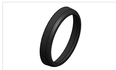
NBR or EPDM Flow Ring for MINERAL pipes with STANDARD socket DN150-1200

The information on this sketch is, to the best of our knowledge correct at the time of printing. However Saint-Gobain are constantly looking at ways of improving their products and services therefore reserve the right to change without prior notice, any of the data shown. Any orders placed will be subject to our Standard Conditions of Sale, available on request.