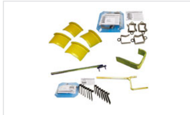
Assembling and disassembling wedges for Universal Ve Joint

The information on this sketch is, to the best of our knowledge correct at the time of printing. However Saint-Gobain are constantly looking at ways of improving their products and services therefore reserve the right to change without prior notice, any of the data shown. Any orders placed will be subject to our Standard Conditions of Sale, available on request.