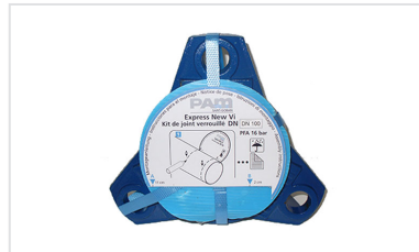
Express New Vi Kit for Express Pipes and Fittings DN60-250

The information on this sketch is, to the best of our knowledge correct at the time of printing. However Saint-Gobain are constantly looking at ways of improving their products and services therefore reserve the right to change without prior notice, any of the data shown. Any orders placed will be subject to our Standard Conditions of Sale, available on request.