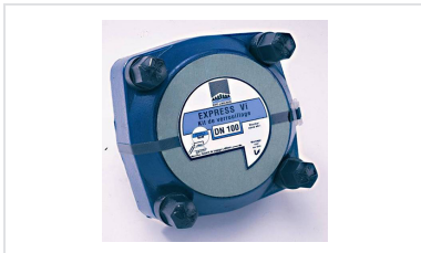
Express Vi Kit for Express Pipes and Fittings DN300