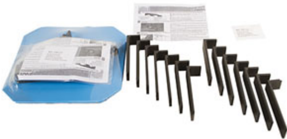
Kit of wedges for dismantling of the Universal Ve Joint

The information on this sketch is, to the best of our knowledge correct at the time of printing. However Saint-Gobain are constantly looking at ways of improving their products and services therefore reserve the right to change without prior notice, any of the data shown. Any orders placed will be subject to our Standard Conditions of Sale, available on request.