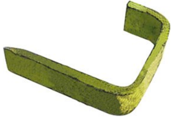
Wedges for dismantling of the Universal Ve / Alpinal / Tis-K Joint