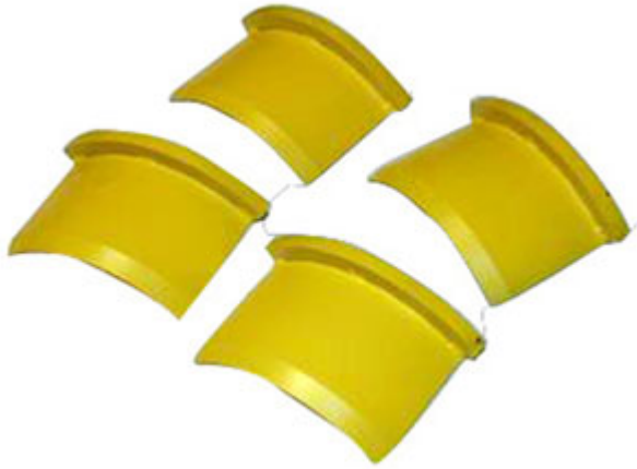
Kit of wedges for dismantling of the Universal Ve / Alpinal / Tis-K Joint