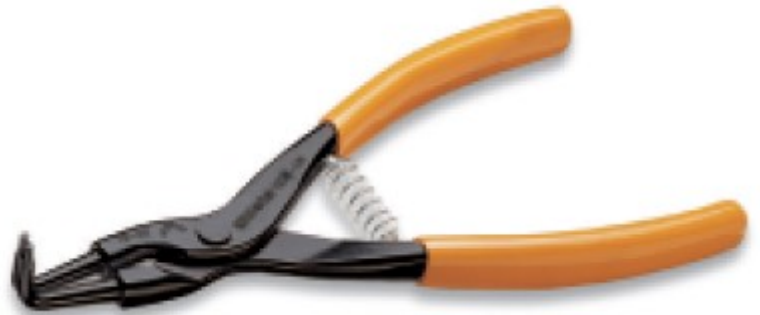
Clamp to install wedge assembly support for Universal Ve / Alpinal ... Tis-k Joint