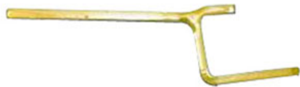
Wedges lever assembly support f... Universal Ve / Alpinal / Tis-K Joint