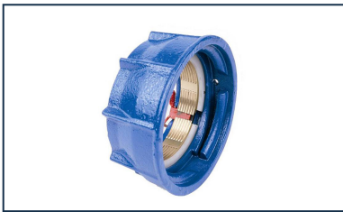
IZIFIT-K anchoring Gland

The information on this sketch is, to the best of our knowledge correct at the time of printing. However Saint-Gobain are constantly looking at ways of improving their products and services therefore reserve the right to change without prior notice, any of the data shown. Any orders placed will be subject to our Standard Conditions of Sale, available on request.