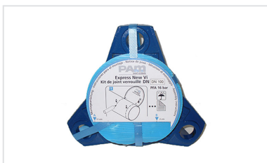
Kit EXP New Vi pour Tuyaux et Raccords EXP DN60-250